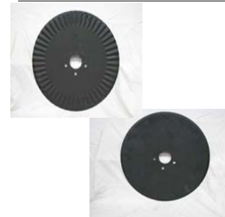
18" and 20" Plain and Fluted Discs

All twin coulters have an off vertical angle applied to the disc, this assists with keeping discs sharp and clean.